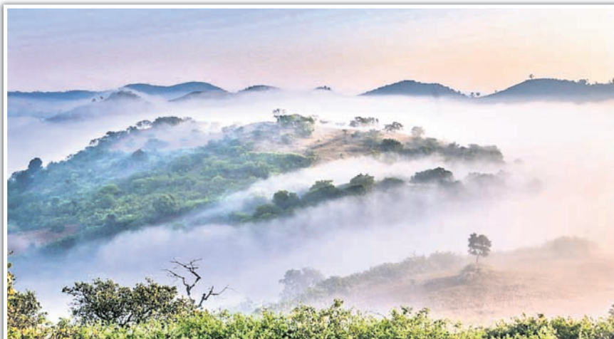
Hill beauties of Koraput

During my growing up years, I had watched the Odia blockbuster Dora . The movie had some songs, featuring Prashanta Nanda and Mahashweta, shot on hills and along the waterfalls. At that time, I was attracted towards a particular scene when the lead couple was shown walking hand in hand near a stream. The frame was frozen in my