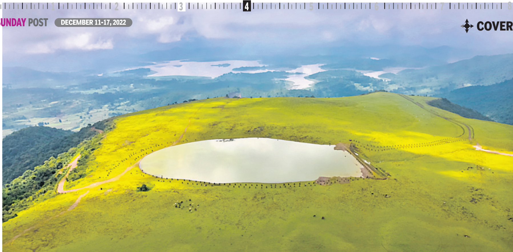
A lake on a table-top mountain(Balda Cave) in Koraput