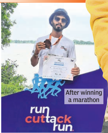
After winning a marathon

My Sundays are absolute 'me-time'. Waking up as early as 5 in the morning, I begin cycling to various places. I try my best to cover a 50 km radius around Bhubaneswar. I do participate in different cyclothons and marathons. Recently I ranked 5th position in Bhubaneswar cyclothon 2022.